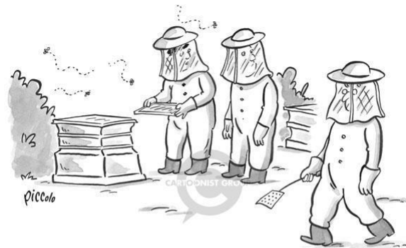
"I don't think the new guy gets it."