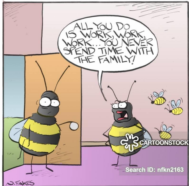
A Worker Bee's Home Life