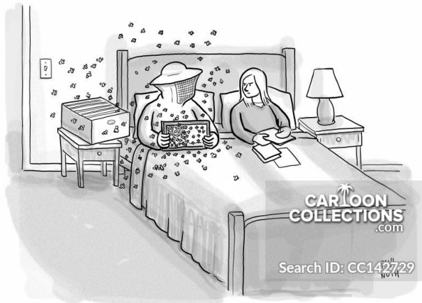
"Ob, but it's fine for you to grade papers?"