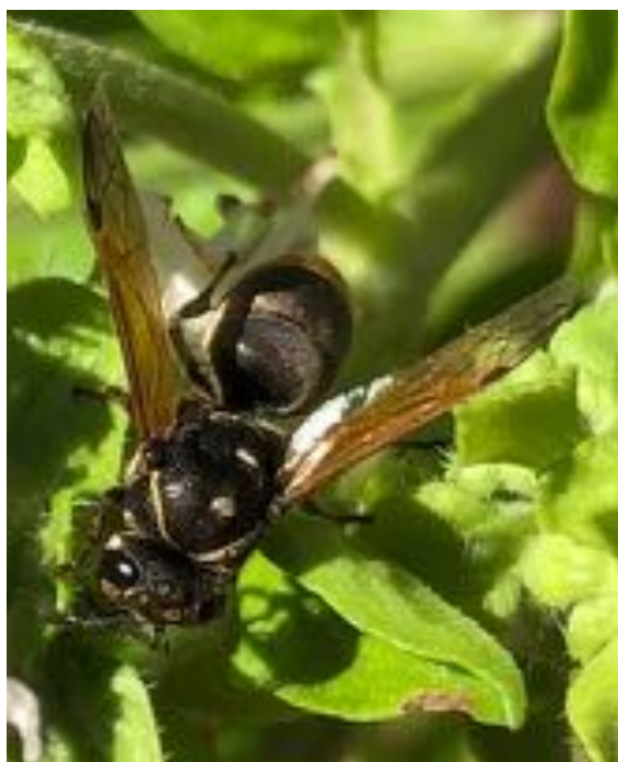
I think this is a Common Masked Bee or a Leaf Face. Let me know if I am wrong.